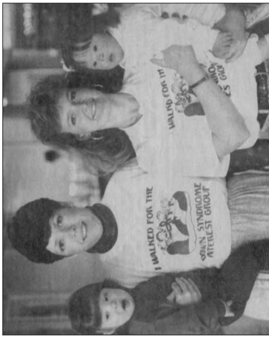
DSIG's 1st "Walk For Our Kids" in 1991