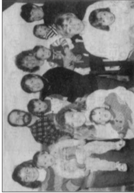
DSIG Founding Members